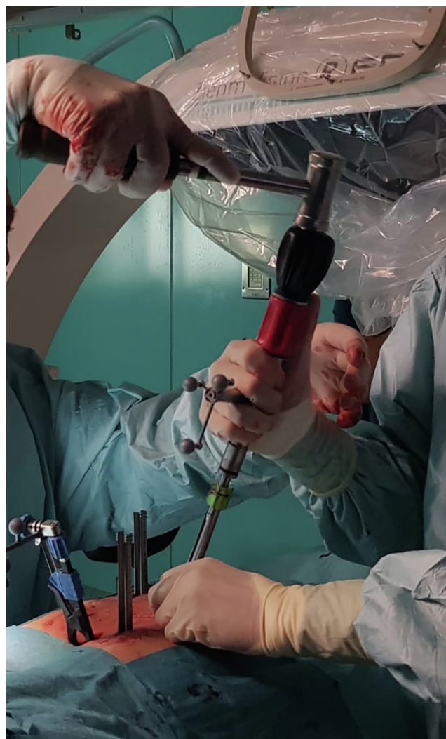
Fig. 2. VIPER PRIME™ “one-step” system (DePuy Synthes) instruments.

After positioning, the registration step is completed with acquisition of the intraoperative points (spinous process - right lamina - left lamina). About 20 points are necessary for the neuronavigator to recognize the position of the reference star related to the patient's anatomy. We proceed to a cutaneous paramedian incision of about 2 cm through which the screw using a navigated screwdriver will be inserted into the pedicle of interest without the need of time-consuming trocar's passages, because of the screw tip that is aggressive. Fig. 2 Due to navigation, it is possible to choose to customize the treatment and to apply larger screws Fig. 3 . The validity of the system is controlled intermittently by positioning a probe on an exact anatomical reference point. Afterwards, fixation procedure can be completed. The accuracy of the placement of the pedicle screws is assessed by a neuroradiologist with a postoperative CT scan, unlike many other centers that rely on postoperative X-ray, with the risk of underestimating the degree of malposition. In fact, in general, low rates of mispositioning exist in the literature: Hicks et al. in their systematic review have found a 4.2% rate of mispositioned pedicle screws [2]. The pedicle violations were classified according to an established classification system [3].