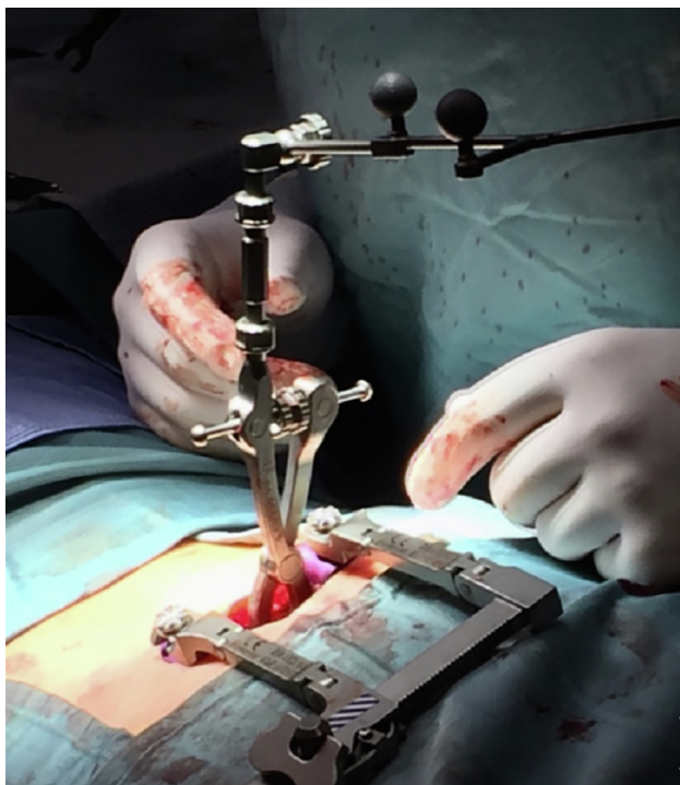
Fig. 1. Positioning of the reference arch onto the spinous process of the vertebra.